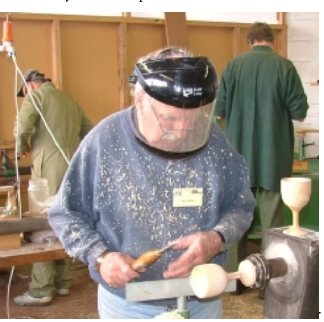
September 2004 - Page 7

Words don't really do it justice, take a stroll through the photographs on www.sawg.org.nz and perhaps next year, we will see you at Participation 2005