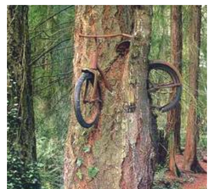
Thought to be Rip Van Winkle's bike.