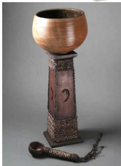
"Anyone for Soup?"