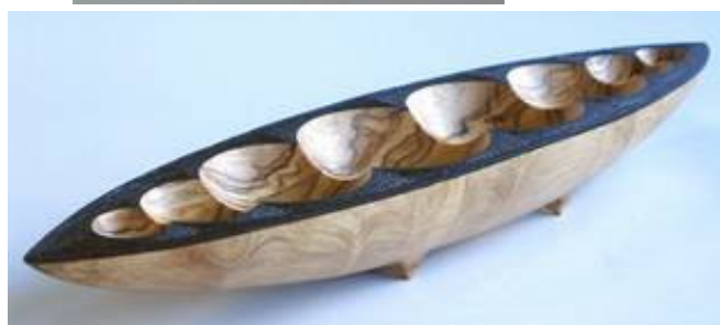
"Off-centre Boat" - black maire, 300mm, set on four feet, pyrography, spray lacquer finish