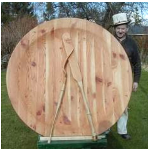
An unknown woodie from Texas gets a bit carried away with his new lathe just to make the Guinness Record Book., we hear.