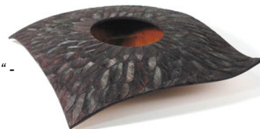
"Monterey with Feathers" -

(Watch this space for the unfolding of the REAL competition - between these two!)