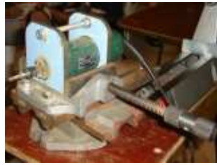
Table that sits on the bed of the lathe which allows the accessories to move and always be correctly aligned.

A gauge , for marking spigots, using drills in a piece of industrial Formica. One end is for 50mm chuck and the other for 100mm chuck. One drill is blunt to sit in the centre mark made in the work piece the other is sharpened to a point to mark the circumference