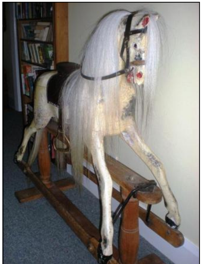
Photos: Top- Before restoration and Dick repairing the saddle, Bottom- An unintentional (but good) pun, Above- Fully restored and ready to delight another three generations of riders (at least)